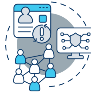
SaaS for Jobs & Recruiting