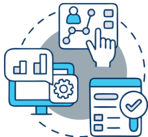
Intelligent Talent Platform

An all-in-one intelligent talent platform & marketplace exchange for jobs, candidates & employers