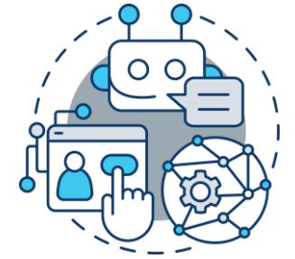
Automated Universal Ecosystem

Connecting the right talent with the right job